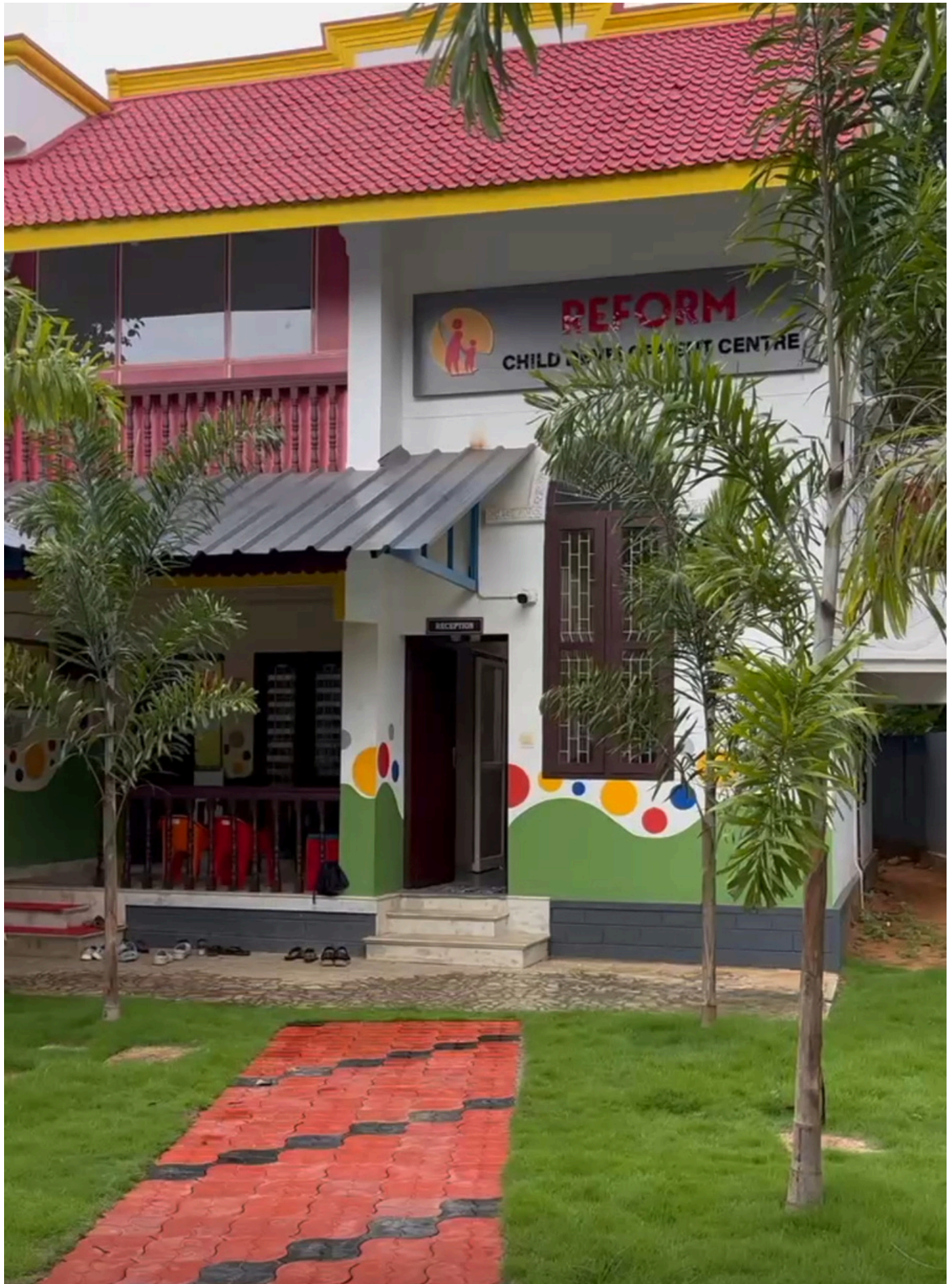
Reform Child Development Centre - Nurturing Abilities & Transforming Lives