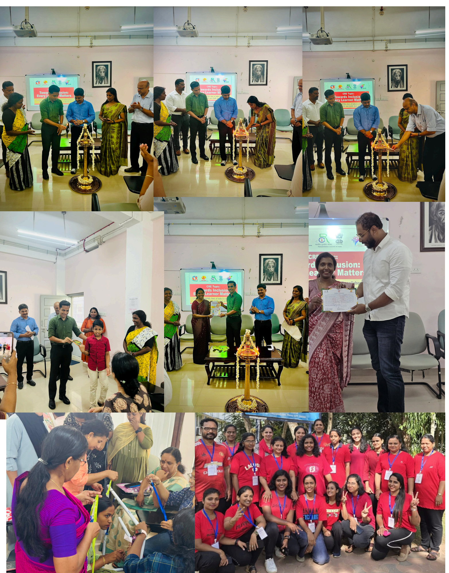
Reform Child Development Centre - Nurturing Abilities & Transforming Lives