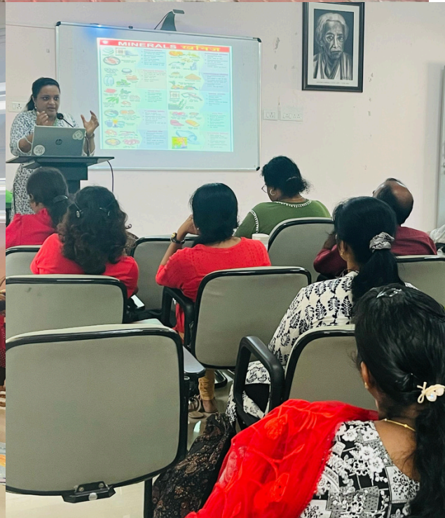
Reform Child Development Centre - Nurturing Abilities & Transforming Lives