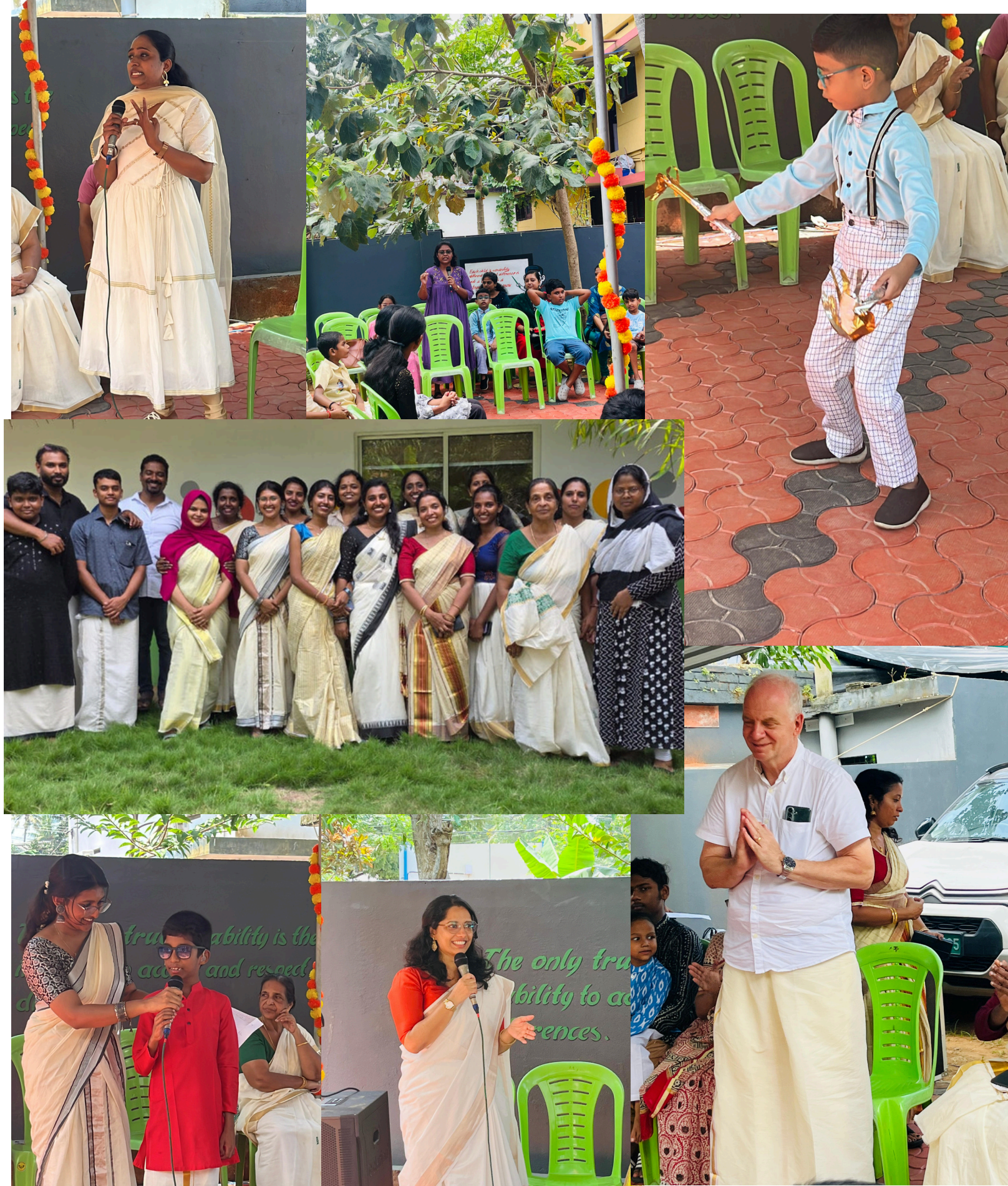
Reform Child Development Centre - Nurturing Abilities & Transforming Lives