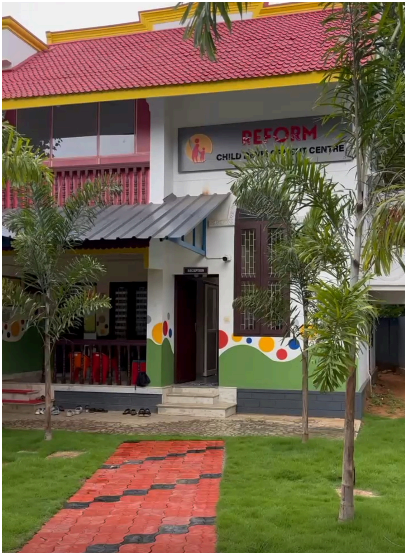
Reform Child Development Centre - Nurturing Abilities & Transforming Lives